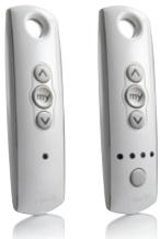
Telis 1 & 4 RTS Hand-held Remotes

Experience the richness of Somfy's exclusive radio control designed with the user in mind. Select from a wide variety of hand-held remotes, wireless wall switches, timers, sensors or a smartphone/tablet app including voice control.