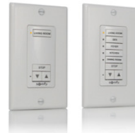
DecoFlex WireFree™ RTS Wall Switches