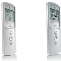
Telis 1 Chronis RTS Timer