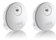
Sunis & ThermoSunis Indoor WireFree™ RTS Sensors