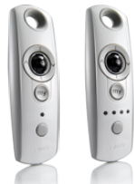
Telis 1 & 4 Modulis RTS Hand-held Remotes